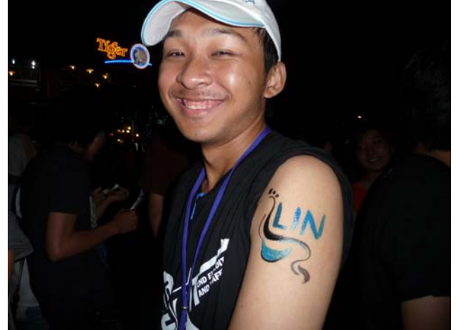
A young, brave visitor to LIN's booth