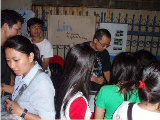
LIN booth looking busy