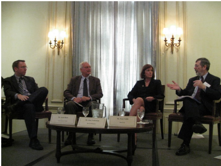
Representatives of volunteer host organizations share their experience

The themes that were addressed during this program related to volunteerism, pro bono services (i.e., the volunteering of professional services), corporate social responsibility and social enterprise. We learned and exchanged experiences through a series of workshops and site visits with individuals and social centers in four cities in the United State of America as of us starting in Washington, DC together and gathering once again at the end of our visit in San Francisco, California.