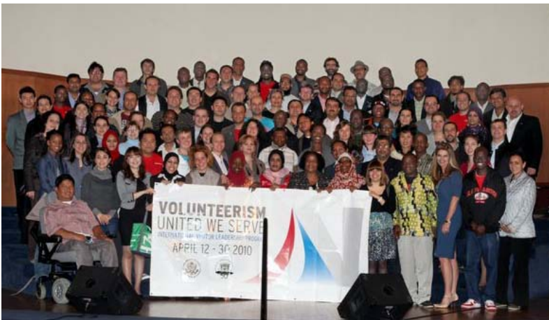
All participants have a chance to meet the first lady of California, Maria Shriver (standing row, the 3 rd from the right)

This is a question that was often asked when we had the chance to meet and visit other volunteer host organizations. And we heard many different answers, depending on the ages of the volunteers. Among the answers we heard, was that volunteers gain life skills, time management skills, they learn how to work with