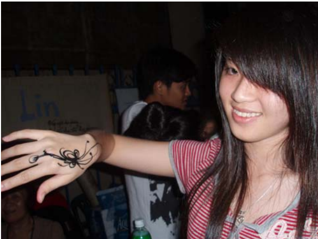
One of the more stylish hand paintings