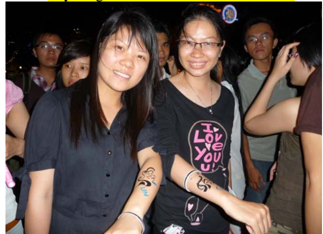
MTV and LIN logos – creative designs by LIN volunteers