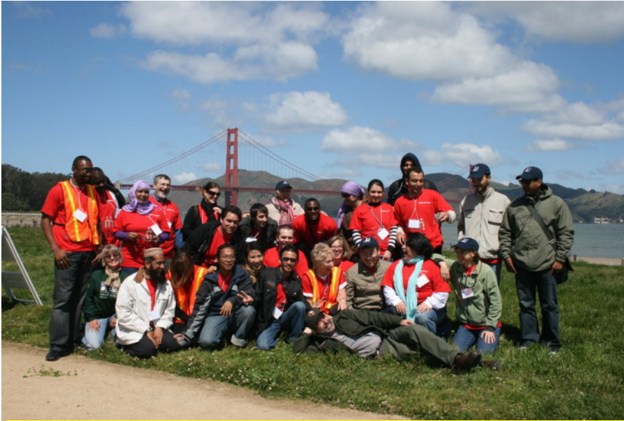
International Volunteer leaders participate in clearing weeds in San Francisco

After meeting with some US NGOs, each of the international visitors had a chance to participate in volunteer programs and activities, which were hosted by NPOs/ NGOs in the US. During the trip, I had three opportunities to volunteer with my friends from other countries: