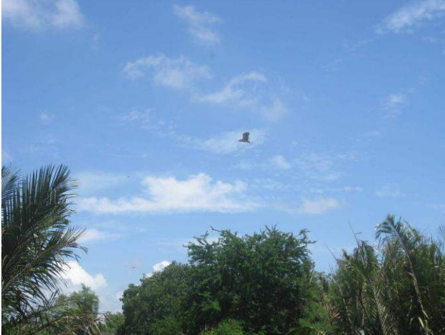
Birds are back to Vam Ho

In June 2011, the LIN staff, together with members of the Charity Cabaret 2010 organizing committee visited two of their funded projects: the Bird Park in Ben Tre Province and the TePhan Love House in HCMC.