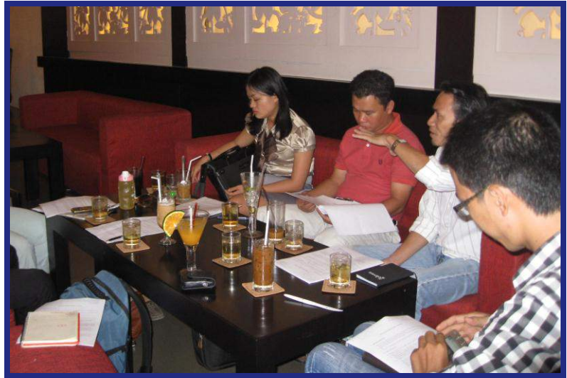
Discussion of NPO Advisory Group's participants

To open the discussion, LIN Center representatives gave a summary of LIN's proposed work plan for 2011 and asked for participant comments. While the advisory group approved of the 2011 work plan, they also provided thoughtful and creative suggestions for other services that LIN might provide to meet NPO needs (such as support with proposal writing; developing standards and best practices for different sized NPOs; and help to bring the NPO and donor communities closer together).