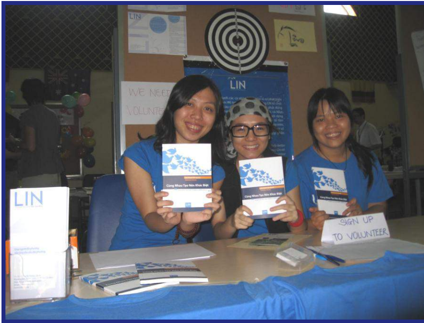
LIN team and volunteers at the introduction booth

The LIN Center joined more than thirty other organizations, including local and international not-for-profits, to promote their work to the local community and the the Federation of British International Schools in South East Asia (FOBISSEA) during a Community Fair hosted by the British International School of HCMC. The Fair took place alongside the FOBISSEA conference and was designed to help international school faculty throughout Southeast Asia think about ways to better engage in their local communities. The March 12 Conference & Community