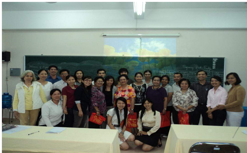
Students and four Social Work professors from the Philippines

The Masters Degree program is a collaboration between the Vietnam University of Labor and Social Affairs and the Women's University of the Philippines. The training was attended by 20 participants, including social workers and trainers from various VNPOs, INGOs, GOs and Universities located in HCMC and other provinces such as Tay Ninh, Dong Thap, Can Tho, Ben Tre and Vinh Long. The courses will be led by Professors from the Women's University of the Philippines and will run from 2011 to 2013.