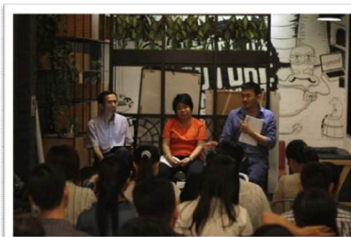
NPO Morning Coffee in May 2016 in collaboration with iSEE and CECM, discussion on “Sustainable Livelihoods”

10 sessions were organized with topics ranged from sharing the expectations of donors on how to engage beneficiaries in transparency and accountability; to understanding needs of beneficiaries; and sustainable livelihoods, etc.