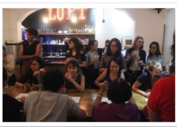
Mandala Night in June 2016 "Speed Dating with NPOs"