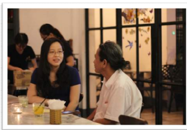
Mandala event in March 2016 on how to bring up the volunteer spirit in corporations. The program was organized in collaboration with UN Volunteers.

10 Mandala events were organized for with ~400 participants; the topics varied from board matching to fail matching stories that inspired and provided guidance for individuals to contribute their skills and time to join NPOs' journey in making social and environmental impacts.