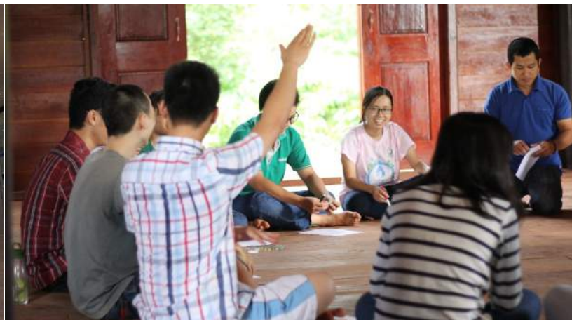
Leadership peer-sharing and training sessions throughout the year